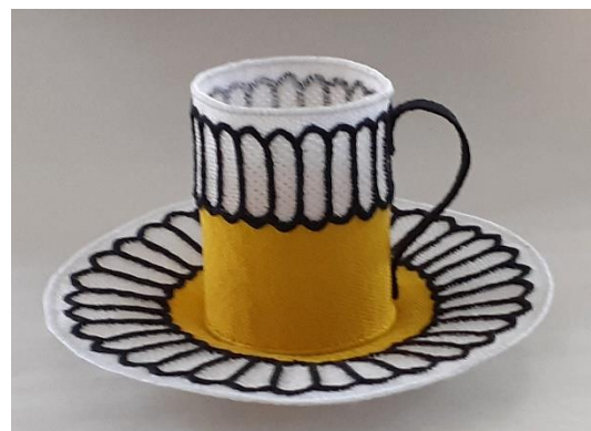
Coffee Time by Pat Brunson

Pat's first thoughts were something to do with our weather. Looking at images of thunderstorms she decided to use meteorological symbols mounted in a deep frame. 20x30x3 Bobbin lace background, needlelace symbols Stranded embroidery and silk threads