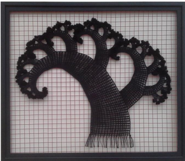
Pythagoras Tree by Pat Brunson