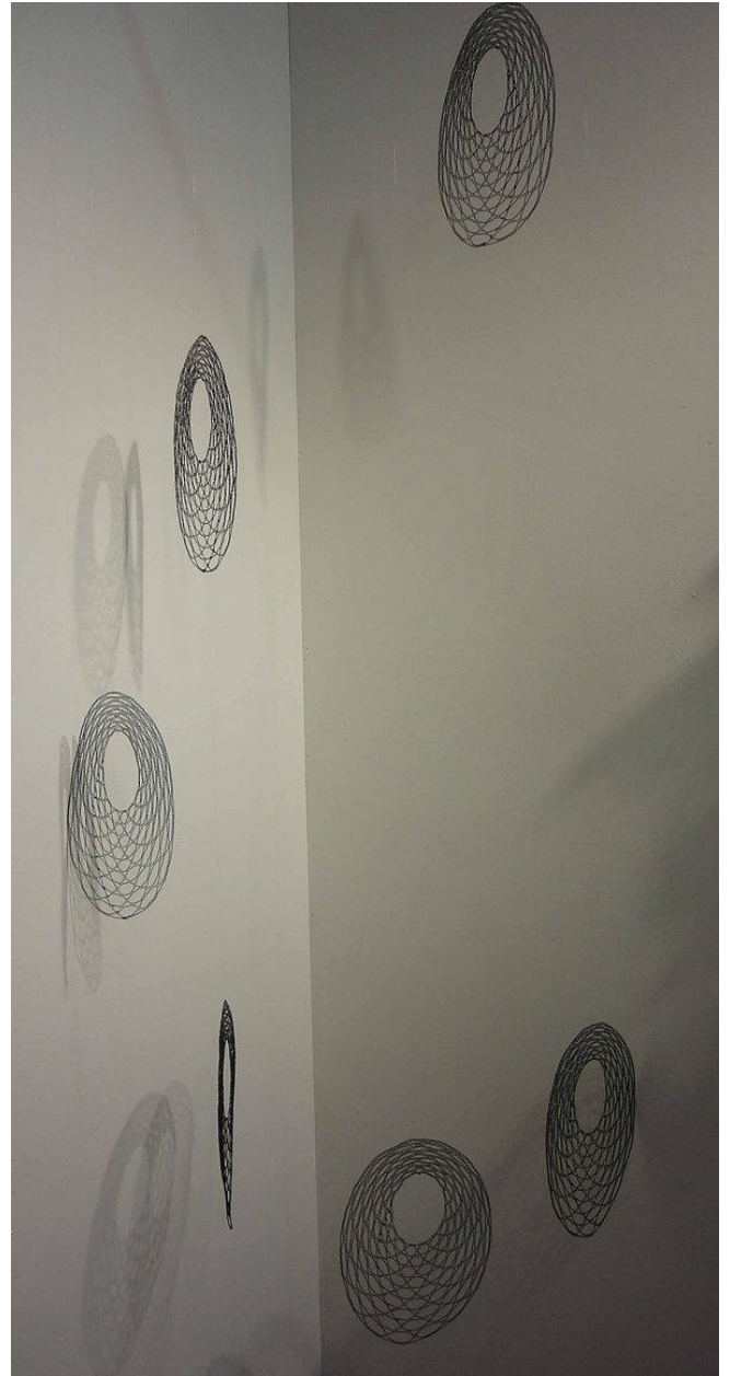
Shadowy corner by Ann Allison Logarithmic ovals throwing shadows. Black covered copper wire. Bobbin lace 190x100x50 Exhibited at Shape Shifting, 2014