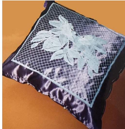
Cushion By Sue Willoughby