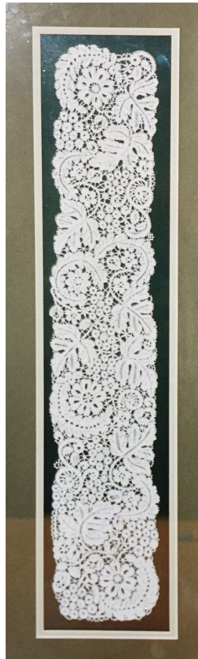
Bedfordshire Panel By Barbara Underwood