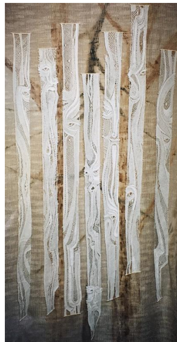
Cleave the wood and I am there by Anne Dyer One of a series of seven 'floorboard' hangings featured in the exhibition