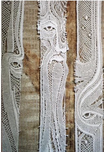
Cleave the wood and I am there, detail by Anne Dyer One of a series of seven 'floorboard' hangings featured in the exhibition