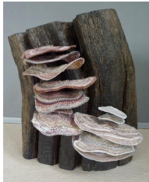
Bracket Fungi by Pat Gibson Needlelace attached to a piece of 'bog oak'. This fungi was growing on a huge log outside the visitors centre at Gilfach nature reserve. 20cm high