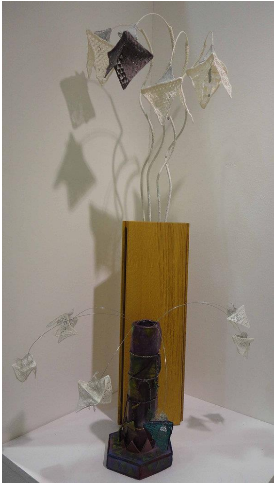
There has to be an odd one, see how they have grown by Pat Gibson

Stylised fushia flowers worked in needlelace using fine paper covered wire and silk thread. The larger flowers are worked using jute and linen. All are attached to cheese wire 90cms high Exhibited at Shape Shifting, 2014