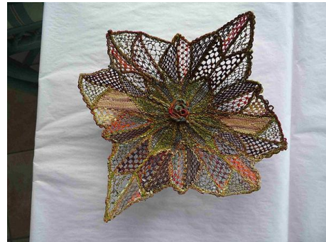
Autumn bowl by Pat Gibson

Made using machine made tape tacked to dissolve and some lace fillings done by machine and then the rest by hand; formed over a bowl while removing some of the dissolvable fabric