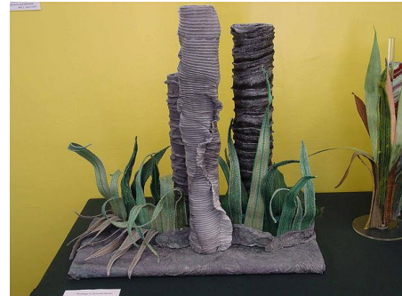
Homage to Pancake Rocks, New Zealand by Pat Gibson Mixed media and needle lace 60x30x45cm

Mixed media and needlelace to depict 'Dutchman's cap' growing in the old kitchen at Aberglasney. 50 x 58