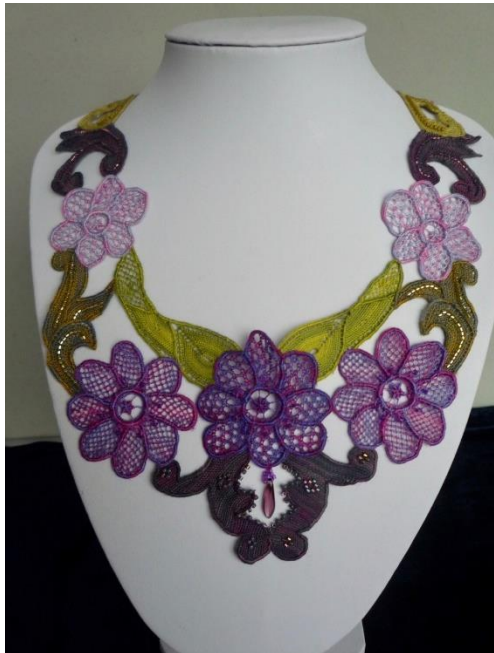
Aberglasney by Pat Gibson

Necklace in needlelace, worked from a pattern for tape lace given to Pat by two Dutch ladies who attended her class at 'Threads go' in Bradford 27cm long