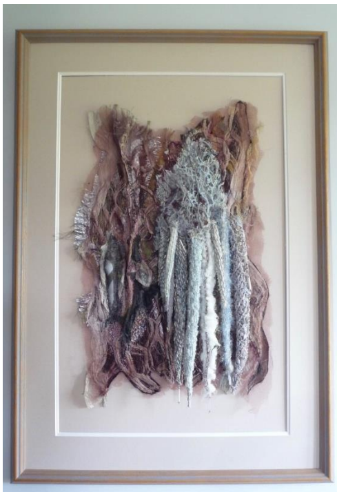
Llanberis Reflections by Pat Gibson Mixed media background and needlelace in 3D to form the icicles. Inspired by photograph of a frozen waterfall in the Lake District. 43 x 26