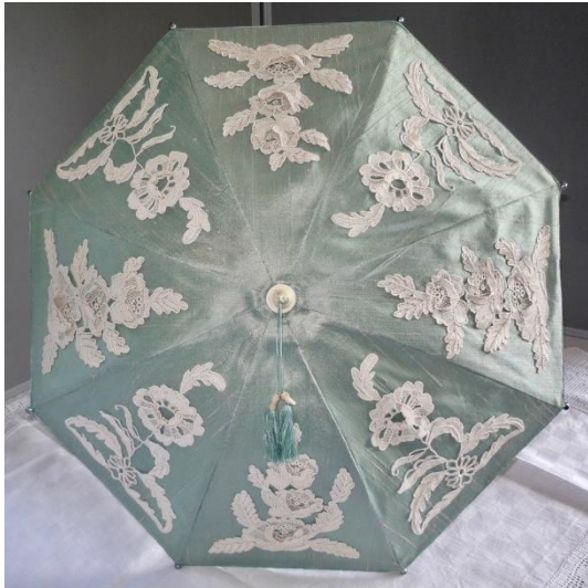
Miniature Carriage Parasol by Pat Gibson Point de Gaze style needlelace 50 diameter