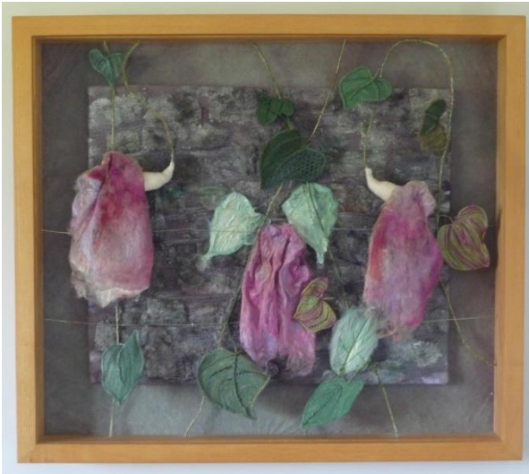
Northern Lights by Pat Gibson

Necklace in needlelace, worked from a pattern for tape lace given to Pat by two Dutch ladies who attended her class at 'Threads go' in Bradford 27cm long