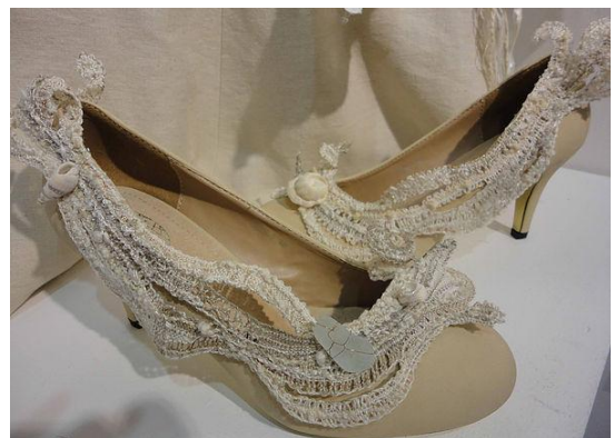
Shifting shoreline 2 by Alison Tolson Shoes with applied bobbin and needlelace inspired by the changing shapes of coastlines and washed up debris 18x23x14 Exhibited at Shape Shifting, 2014