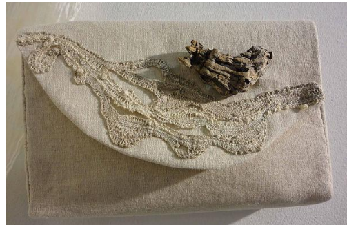
Driftwood by Alison Tolson Handbag with bobbin lace inspired by driftwood found on Fife beach 20x35 Exhibited at Shape Shifting, 2014