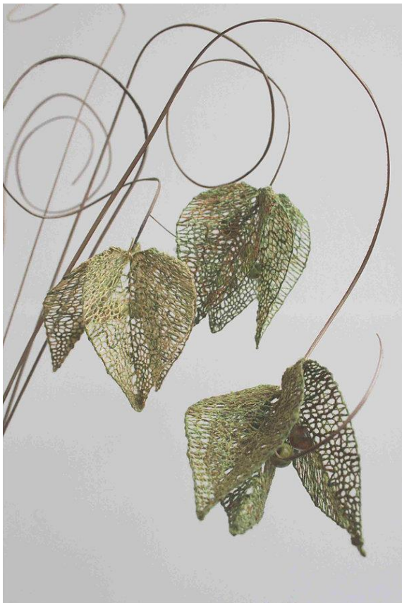
Seed pods