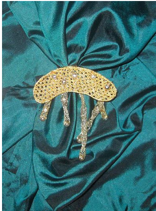
Something 3-dimensional by Gil Dye