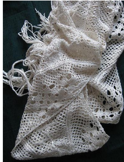
Silk scarf by Gil Dye