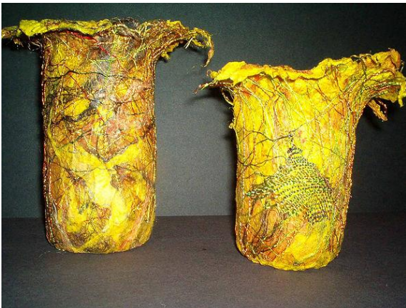
Captivate 1 and 2 by Mary Coleman Copper wire, thread and silk paper 15x9x9cm and 12x8x8cm