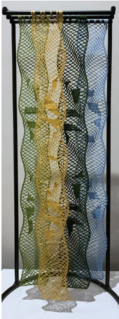
Colours of Mount Grace by Pamela Layzell 61 x 24 x 15