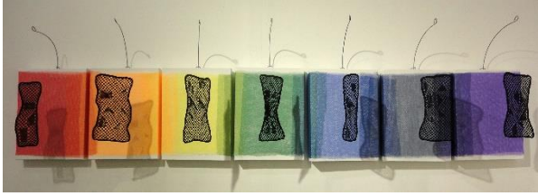
All of the Colours are Black by Pamela Layzell 42 x 180 x 22