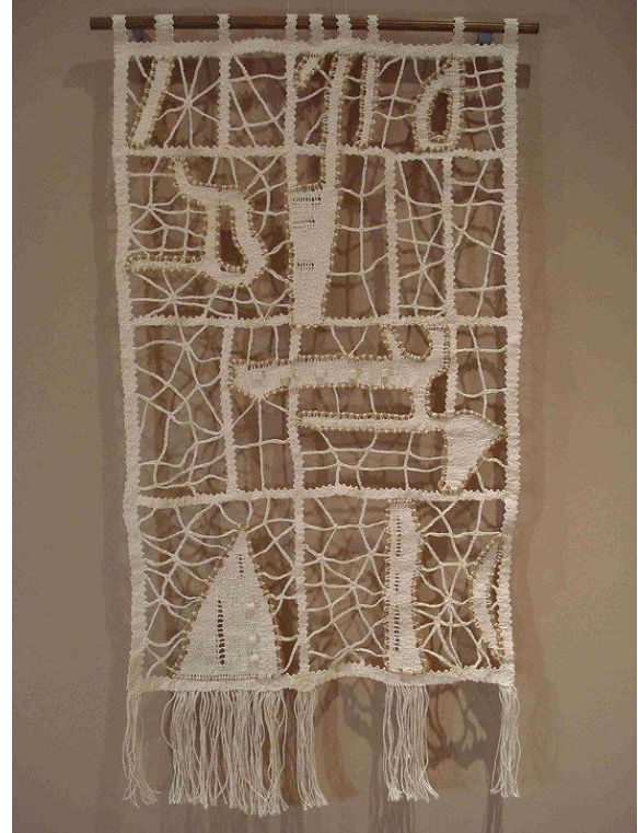
Wall hanging by Pamela Layzell Linen and string 87x46cm