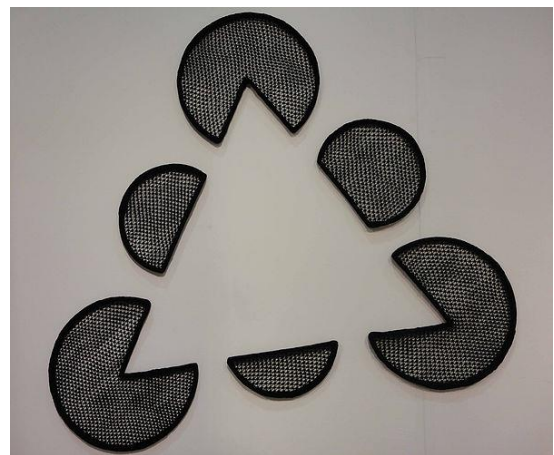
What Triangle? by Pamela Layzell

Is there a triangle here? Needlelace on wooden frames 100 x 100 Exhibited at Shape Shifting, 2014