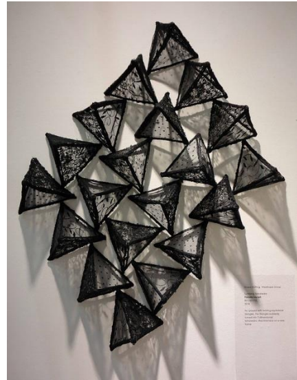
Tumbling tetrahedra by Pamela Layzell

As I played with twisting equilateral triangles, the triangles suddenly turned into 3 dimensional tetrahedra. Machine lace on a wire frame 80 x 65 x 12 Exhibited at Shape Shifting, 2014