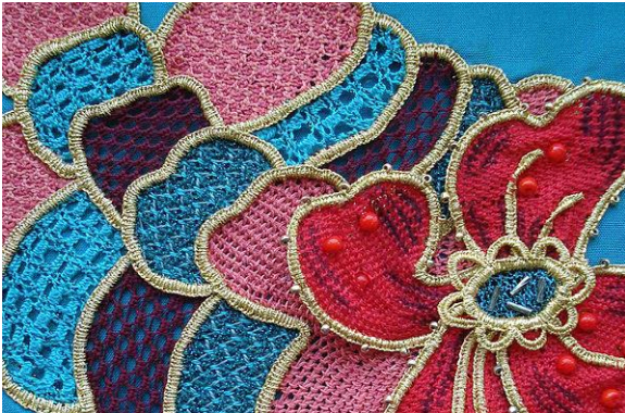
Silk bag by Pamela Layzell