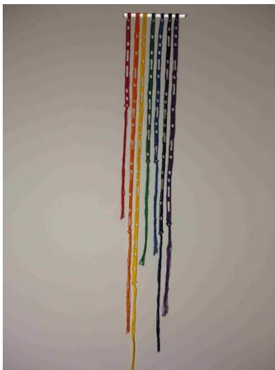
Morse rainbow by Pamela Layzell 15cm x 95cm

As I played with twisting equilateral triangles, the triangles suddenly turned into 3 dimensional tetrahedra. Machine lace on a wire frame 80 x 65 x 12 Exhibited at Shape Shifting, 2014