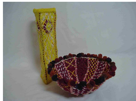
Contrasting vessels by Pamela Layzell Vase: 18cm x 5cm Bowl: 12cm x 6cm