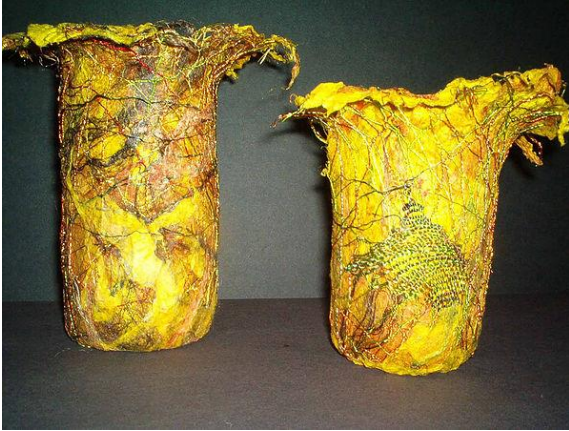
Captivate 1 and 2