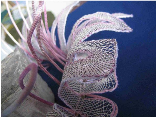
Royal Crescent collar by Kitty Mason Detailed view