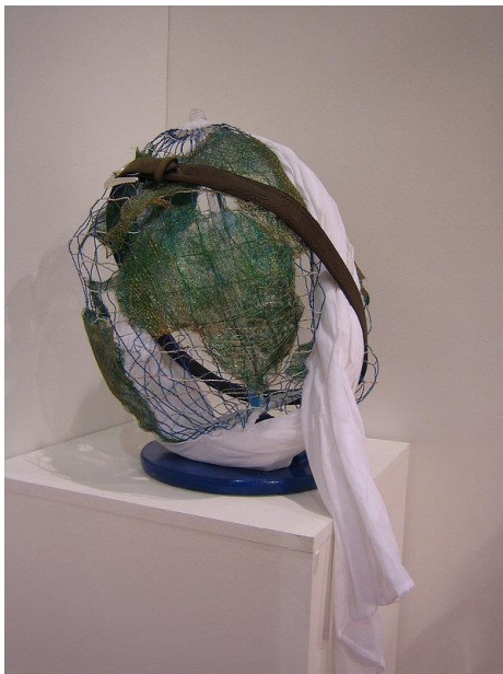
Out of kilter