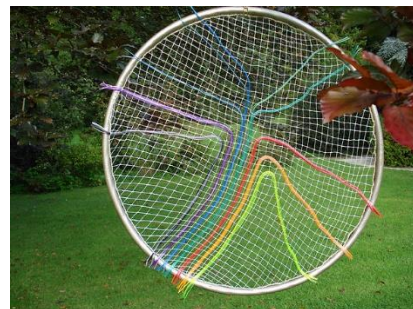
Tree earrings 2 by Kitty Mason With echoes of the carriage wheels in the Springs and Wheels gallery at Stockwood Discovery Centre, these earrings for trees aim to brighten the short, bleak days of winter. Bobbin lace. Exhibited at Inside Out, 2010