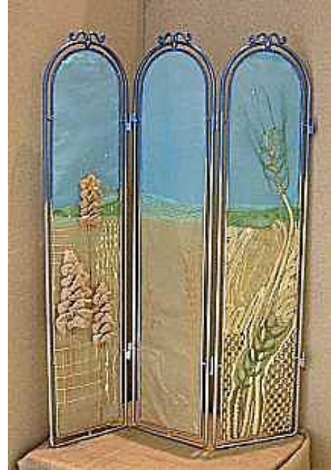
Fields of gold