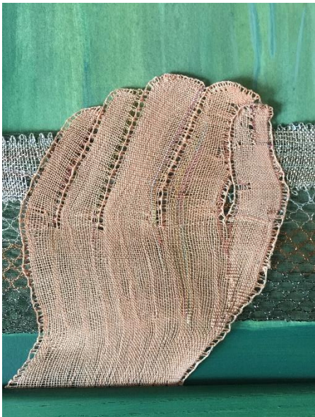
Dreaming dreams or living the nightmare (detail) by Kitty Mason

Experiencing increased anxiety after Covid, Kitty became interested in the colours of mood, suggested by internet research. The darkness has not gone but more colour has reappeared. 38x27x27 Bobbin lace Mixed threads, poly bags