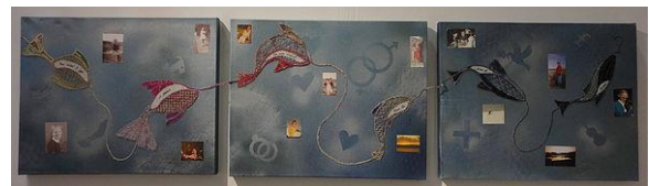
The older I get by Kitty Mason Three panels in bobbin lace in a mixture of techniques and materials, including cotton, synthetic and metallic threads and meaningful objects, photographs and pictures 163 x 40 Exhibited at Shape Shifting, 2014