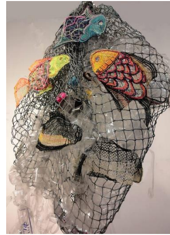
If wishes were fishes by Kitty Mason A wall hanging in bobbin lace using a mixture of techniques in cotton, linen, synthetic and metallic threads on a base of knotted netting 100 x 100 Exhibited at Shape Shifting, 2014